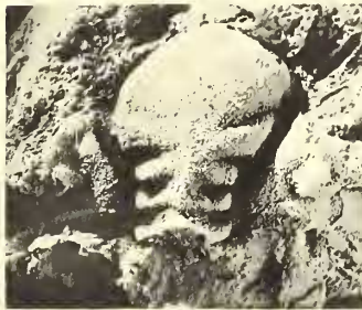
8 x 2.4